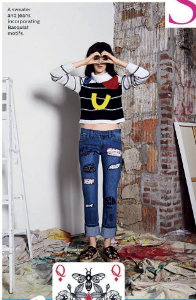
A sweater and jeans incorporating Basquiat motifs.