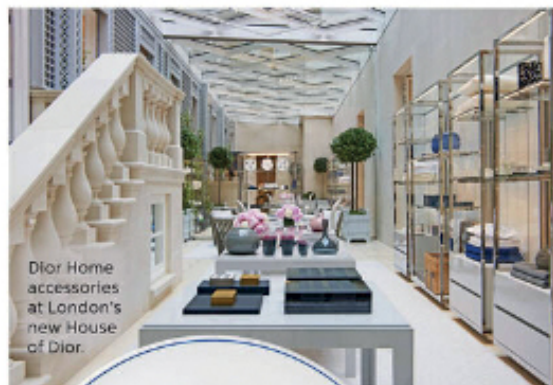
Dior Home accessories at London's new House of Dior.