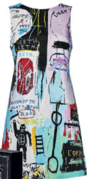
A dress and clutch inspired by Basquiat's paintings.

Few artists rose to stardom as swiftly as Jean-Michel Basquiat, who was 20 when his graffiti-inspired paintings were included in a gallery show alongside work by luminaries Jenny Holzer and Kiki Smith. Merging Afro-Caribbean style with a punk, street-art sensibility, the Brooklyn-born Basquiat blazed a trail across the downtown New York art scene of the 1980s before his untimely death at age 27. Now Alice + Olivia—the ultracool womenswear label beloved by Michelle Obama, Taylor Swift, and Beyoncé—is partnering with the Basquiat estate to create an array of clothing and accessories featuring the flamboyant artist's instantly recognizable motifs. A clutch and a knit top bear his signature gold crown, a leather jacket is embellished with his characteristic paint daubs and a lightning bolt, and jeans, skirts, and bags are adorned with scribbly texts and manic pictograms. Fittingly, half of the proceeds will go to the Council of Fashion Designers of America, which promotes the efforts of budding talents ( aliceandolivia.com ).